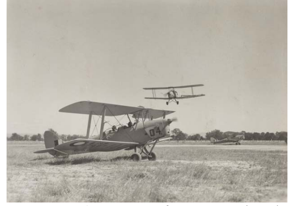
5EFTS Tiger Moth training aircraft at Narromine.

In June 1942, Fred embarked for overseas to Canada to continue his flying training. From