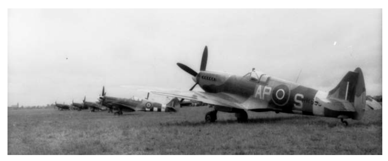
130 SQN Spitfires dispersed at a grass airfield at Grave in Holland in 1944.

At the beginning of October 1944, 130 SQN shifted to Grave, the Netherlands, becoming part of No 125 Wing, 2<sup>nd</sup> Tactical Air Force. From Grave, Fred flew patrols to counter German Me 262 jet fighters and undertook low-level armed reconnaissance missions over the Netherlands and Germany. After enduring almost daily deadly bombing raids by Me 262s, 130 SQN was shifted to Diest, Belgium at the beginning of November. On 8 December 1944, Fred and eight of his colleagues were conducting a long range armed reconnaissance mission deep inside Germany when they were jumped by a larger force of enemy fighters. During the engagement, Fred engaged an Me 109 which was later confirmed as destroyed.